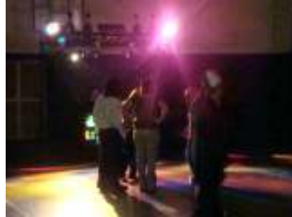
Having tons of fun at the GREEN DANCE!